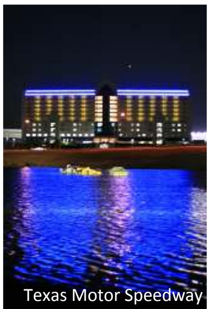
Texas Motor Speedway