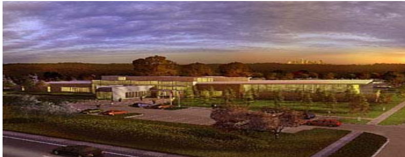
The official groundbreaking was Nov. 13 for Dallas' south central police station, shown in an artist's rendering.